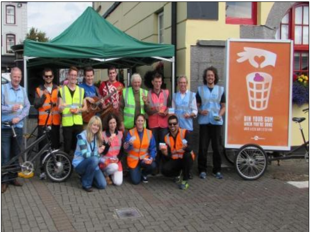
Gum litter awareness campaign Ennis 2017

Clare County Council in conjunction with local Tidy Towns groups in Kilrush, Shannon and Ennis participated in the National Gum Litter Taskforce Campaign – Kilrush (2015); Shannon (2016); Ennis (2017).