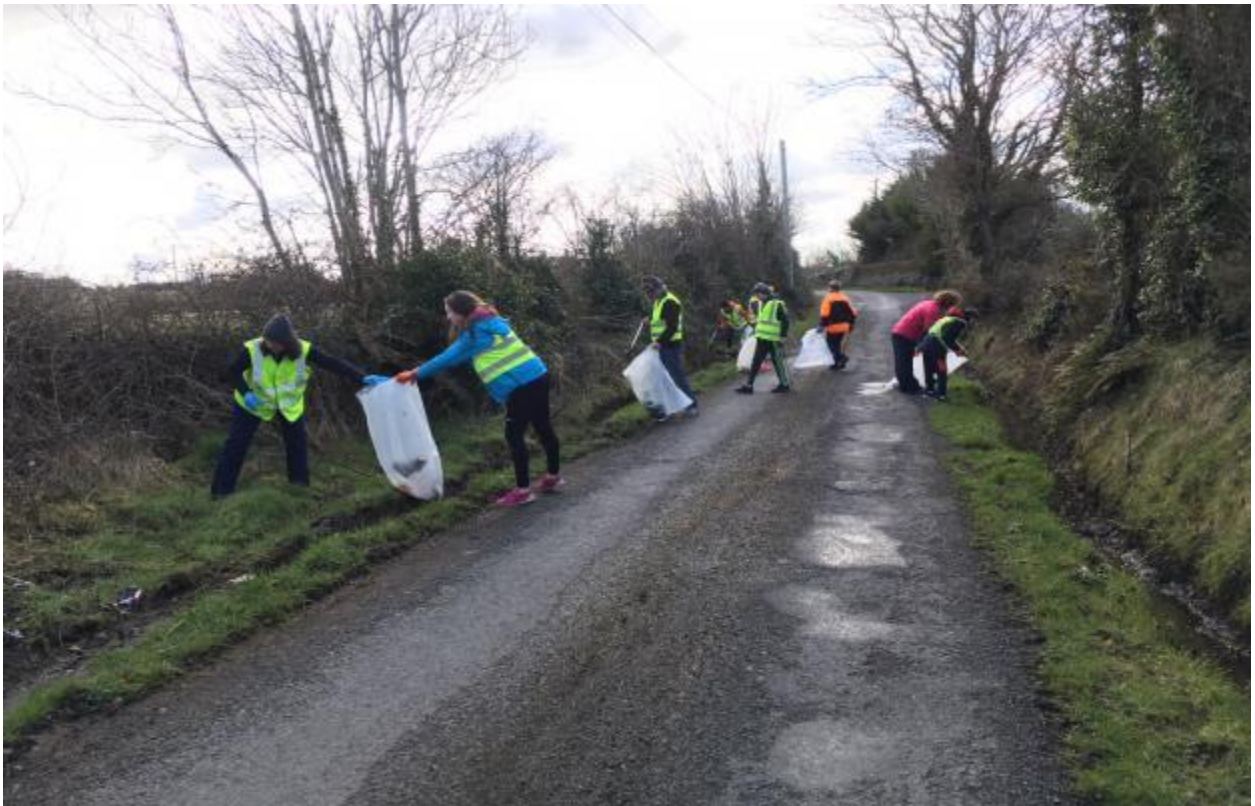
Spring Clean April 2017

Large number of groups participated in An Taisce National Spring Clean and Clean Coast initiatives. Many businesses including Burren Eco-Tourism Network also participated in local clean ups including Adopt a Hedgerow initiatives. Clean ups are supported by Clare County Council through the provision of free passes to Recycling and Transfer Stations as well as provision of litter pickers, gloves and bags.