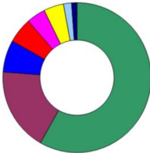
Litter Composition in Clare County Council, 2017