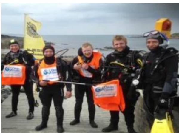
Clean coast group in action

During the Blue Flag beach season campaigns were carried out in conjunction with Clare FM (2015); Clare FM (2016); Spin FM (2017) and Clare FM (2018). As part of the outside broadcasts radio adverts, social media posts, radio interviews highlight the importance of protecting the beach environment from littering and illegal dumping. Waste prevention, recycling tips, Clare County Council recycling Centres; Green Dog Walkers Scheme; An Taisce Clean Coast and #2MinuteBeachClean were all promoted as part of the Blue Flag Beach Campaigns.