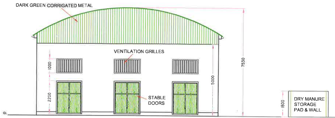
FRONT & REAR ELEVATION (same on both sides) SCALE 1:100