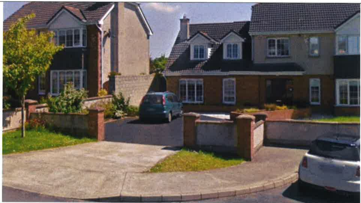
The solid escape door would be on the side gable of the house facing the high boundary wall

The proposed door faces the high concrete mutual boundary wall to the blank gable of the adjoining property.