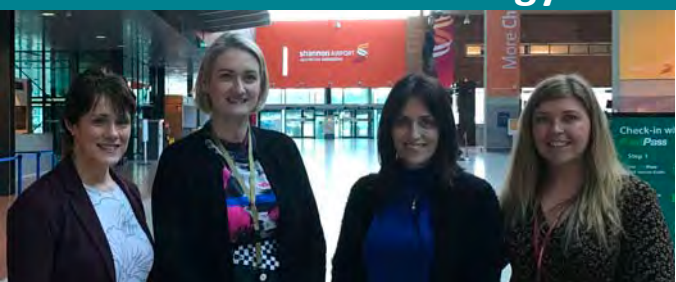
Staff from the Tourism Department exploring marketing opportunities for County Clare with Shannon Group staff at Shannon Airport.